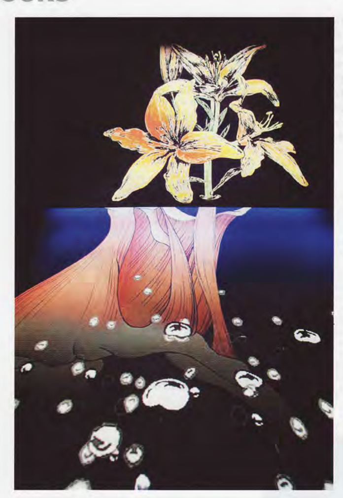
Tabaimo: BLOW , 2009, video installation, approx. 3%-minute loop.

society. Another is Tsuyoshi Ozawa, whose series have included boxes functioning as mini white-cube galleries, hung in public spaces or worn as backpacks; photographs or drawings of the endearing little statues of the bodhisattva Jizo found in numerous locations; and a Soy Sauce Museum of masterpieces reproduced in the namesake condiment.